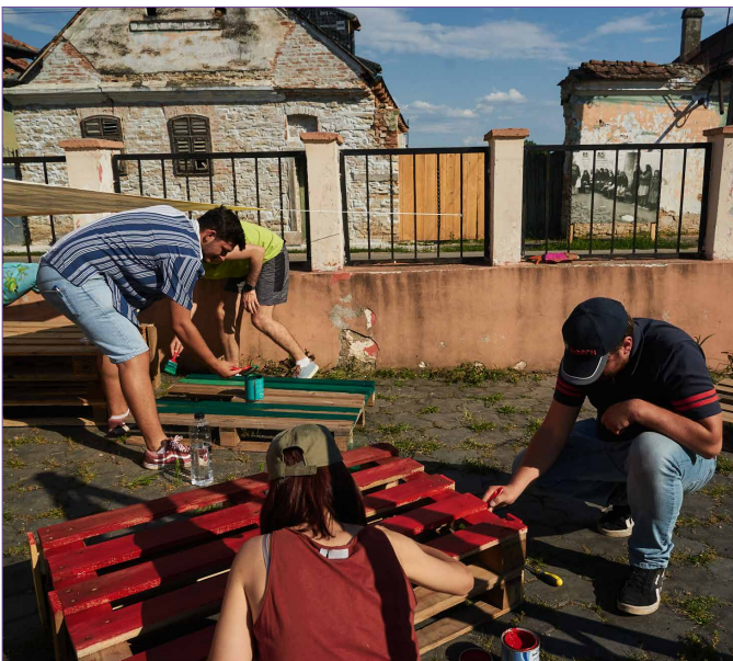
Colour you life: space intervention in the concrete yard of the local camine culturale in Sona.

The Şona Noastră" Village Association is a non-governmental and non-profit association and aims to rebuild the local community by capitalizing on the cultural, economic, social, ecological and natural potential. The association is located in the village of Şona and it is based in a traditional household transformed into cultural space and artists residence.