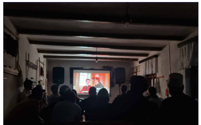
Screening and discussion: „I weld you a colour“ documents a project by OMA from Germany and gave an excellent base for our peer exchange.