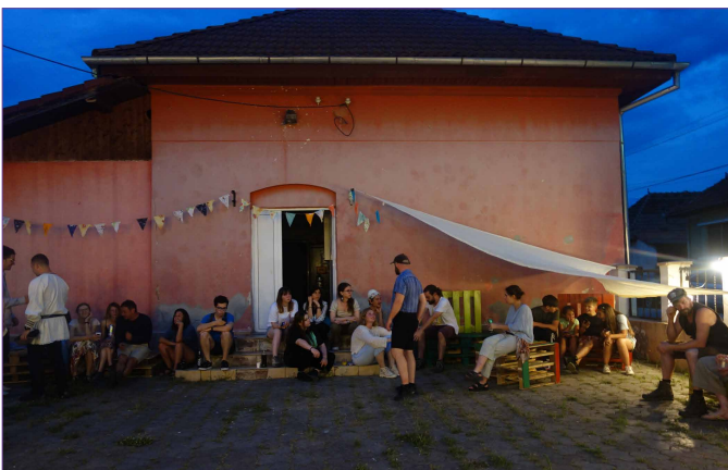
Reclaim public spaces: temporary actions with the youth of Sona in the more or less abandoned location of the cultural house.