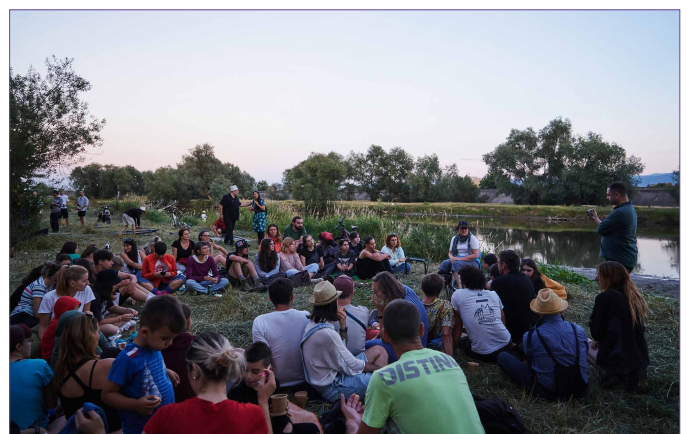
Listen to the past: story telling about the river and a presentation of ancient wisdom around nature and local food in the region.