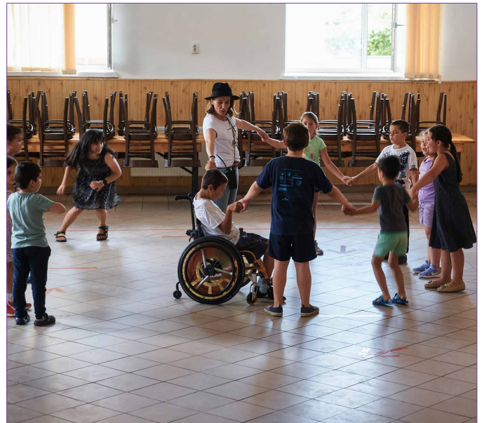
Learning by doing: theatre and dance workshops in the afternoon with kids and adults from the village.