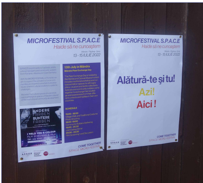
Coming together: collaborative event in the village of Mandra with local cultural workers and community activists from the region.