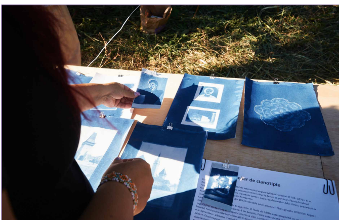
Creative practices: involving all generations by workshops and collective actions to support the idea of the commons.