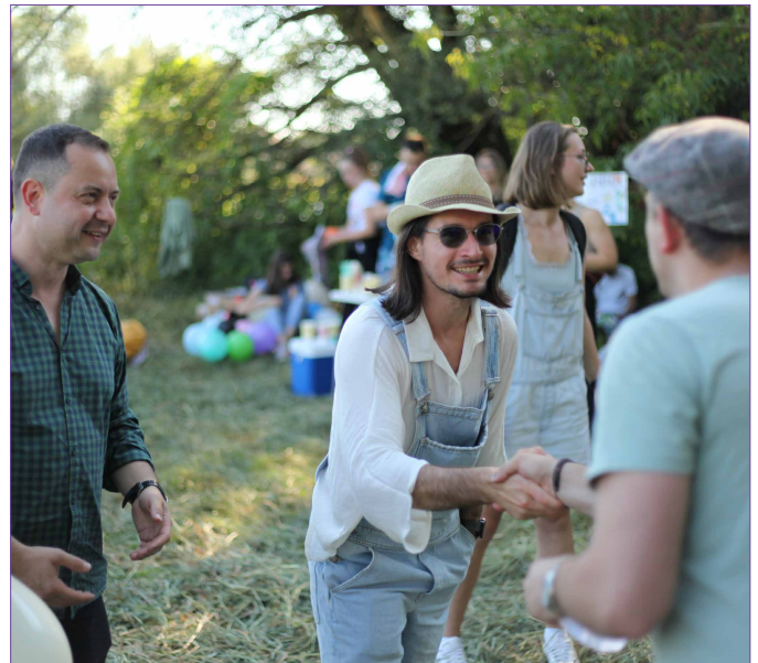
Connect people: more then 300 people came to join the afternoon at the river. Making new friends or just say hello to the neighbors.