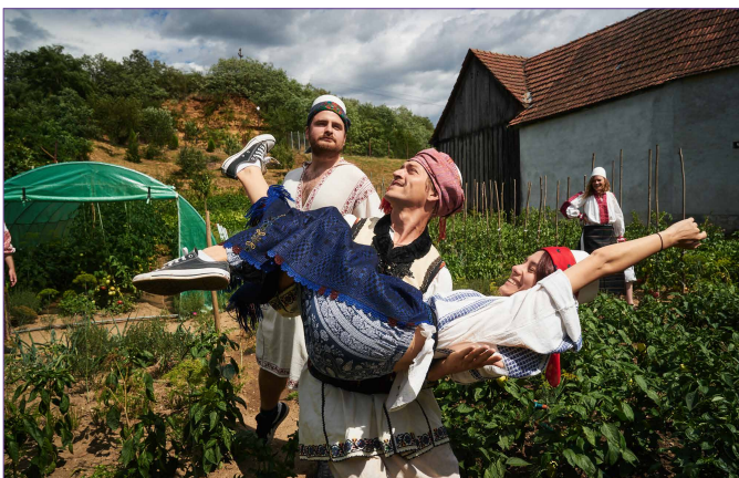
Living heritage: Traditional costume photo shooting in the garden of Canvas and Stories Museum.