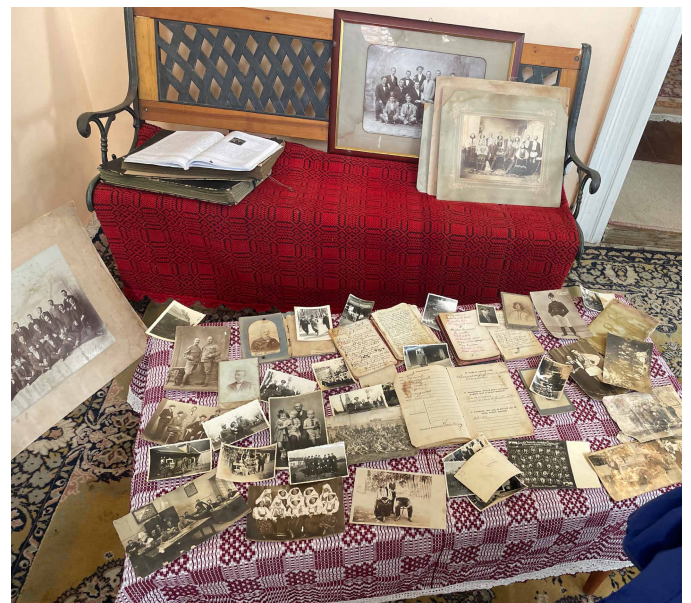
Open doors: invitation to a private photo collection about the history of Mandra during the village walk.