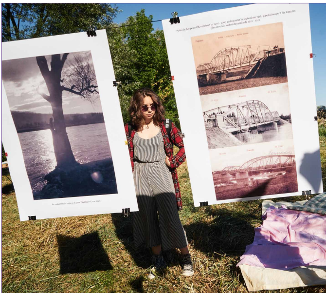
Space making: here at the river Olt by a pop-up exhibition presenting photographers from Fagaras and historic views of the river.

Fundatia Comunitara Tara Fagarasului supports local NGOs, civic associations, civic initiatives, as well as individuals, youth, seniors and companies, in their desire to make the city and surrounding county a better place to live. MKBT: Make Better works as a local development advisor, assisting both public and private entities. That is to say that they are drafting, validating and coordinating processes for local development and urban regeneration.