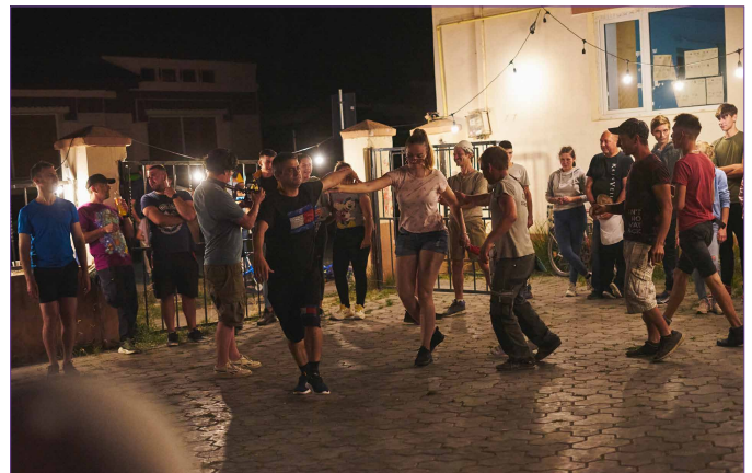
Celebrate together: village party into the night with about 150 guests in the house and outside.